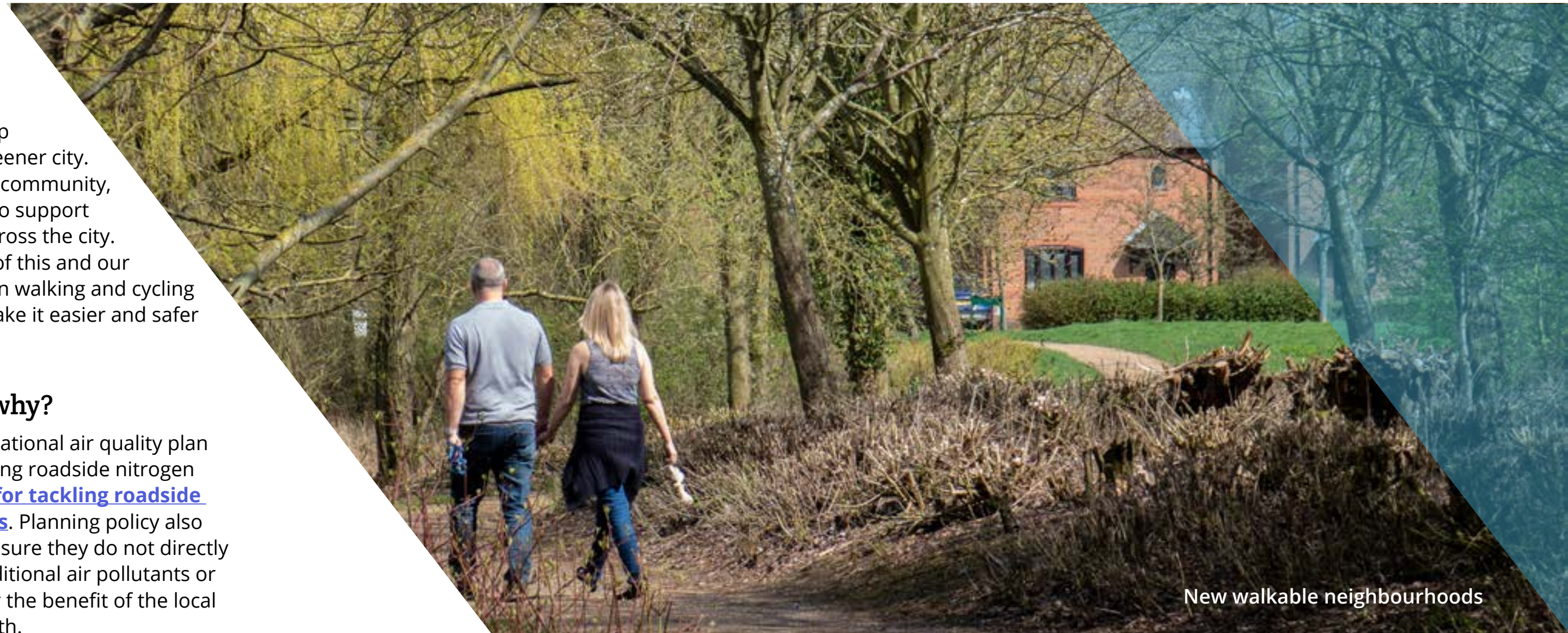
New walkable neighbourhoods

As part of the package of mitigation measures, we have agreed to sponsor a city bicycle hire scheme, which will be available for everyone to use. We hope this will be beneficial to the city's tourist economy and help those who want to use their cars less often, or do not own a car.