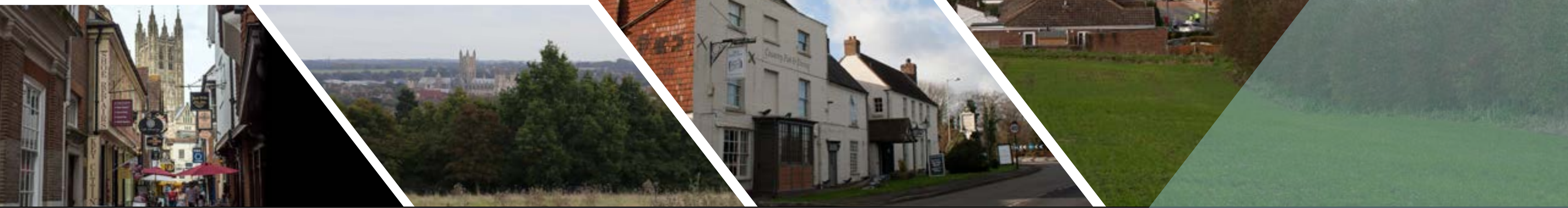
View of Canterbury Cathedral from the site

The special and distinctive World Heritage Site in Canterbury will be protected and views of the city and its landmarks from key parts of the site will be publicly accessible for the first time. We hope that in time the development will become a fully integrated and popular part of the city's fabric.