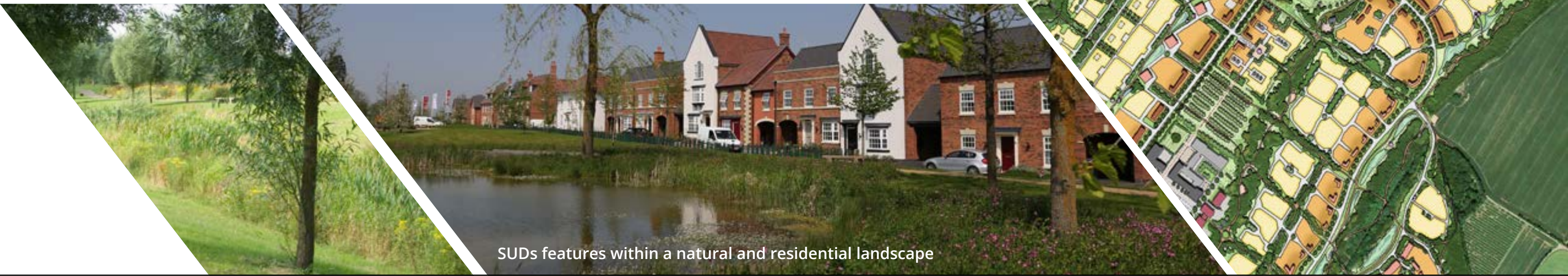
SUDs features within a natural and residential landscape

SuDS also have a role to play in delivering 'nutrient neutrality' (in accordance with Natural England's requirements) as wetlands help to clean surface water before it enters streams and rivers. We will be working closely with the relevant authorities to monitor and manage water quality.